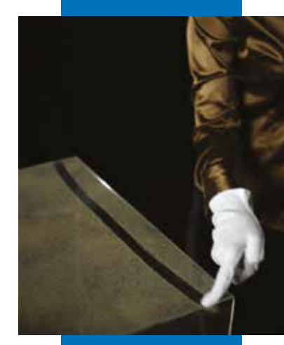
With a traditional cementitious product