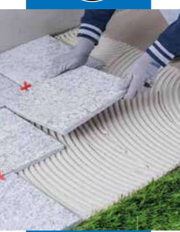
Installation of natural stone in exterior