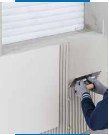
Installation of large-size ceramic tiles