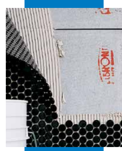
Tiling on fibre-cement