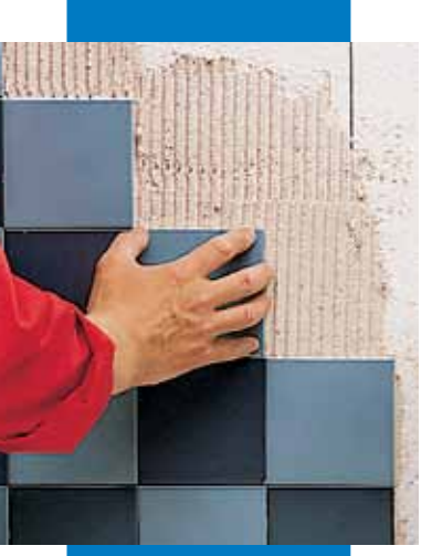
Tiling on expanded polystyrene

All relevant references for the product are available upon request and from www.mapei.com