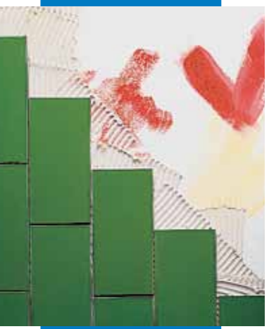
Tiling on painted walls