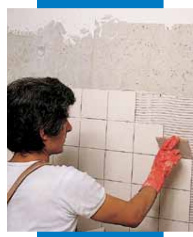
Tiling on reinforcedconcrete walls