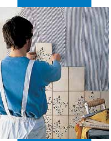
Tiling on ordinary plaster

In these situations, use specialized products from the MAPEI range.