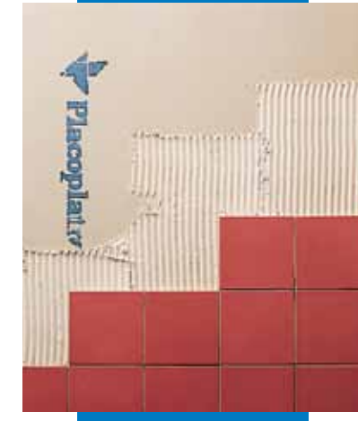
Tiling on gypsum board