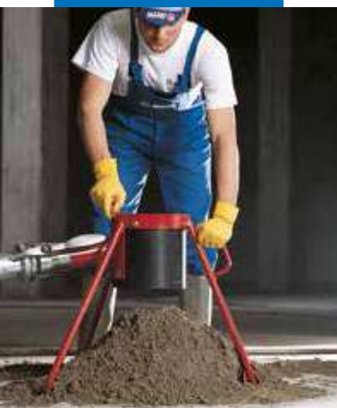
Batching a Topcem mix