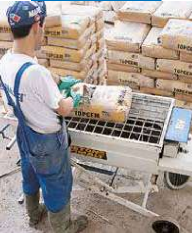
Mixing Topcem in a mini-batcher