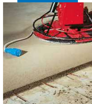
Power floating the surface of a Topcem screed