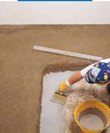
Spreading the anchoring slurry for bonded Topcem screeds