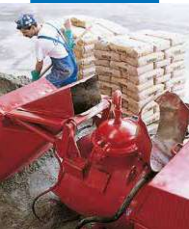
Mixing Topcem with an automatic pumping unit