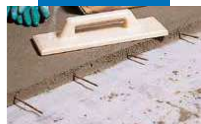
Detail of a Topcem screed with reinforcement rods