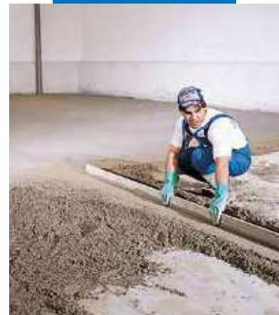
Preparing a levelling strip

Please refer to the current version of the Technical Data Sheet, available from our website www.mapei.com