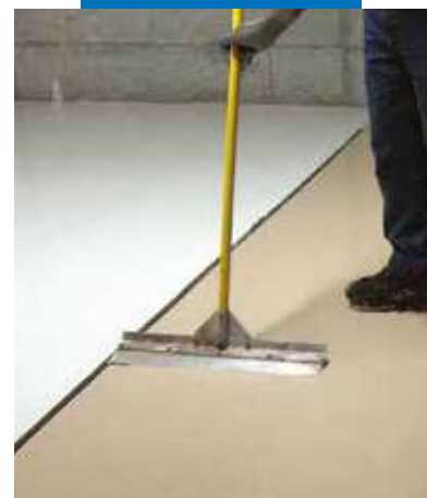
Smoothing Ultratop immediately after spreading