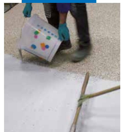
Application of Ultratop on the hardened surface of the mixture made of natural aggregates + Mapefloor 910