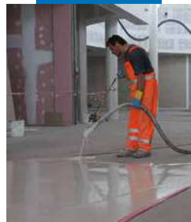
Mechanical application of Ultratop