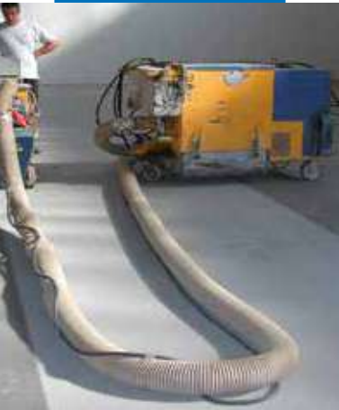
Preparation of the substrate by shot-blasting

If Ultratop is applied in civil buildings (apartments, shops, etc.) where the rooms are smaller than 50 m 2 , include distribution joints in correspondence with door-sills or where there is a significant