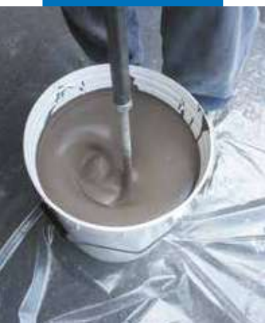
Preparation of the product with a drill