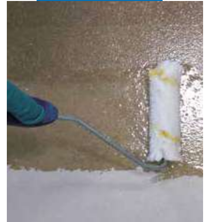
“Terrazzo alla veneziana” effect. Application of Mapefloor I 910

After the finishing treatment, apply a coat