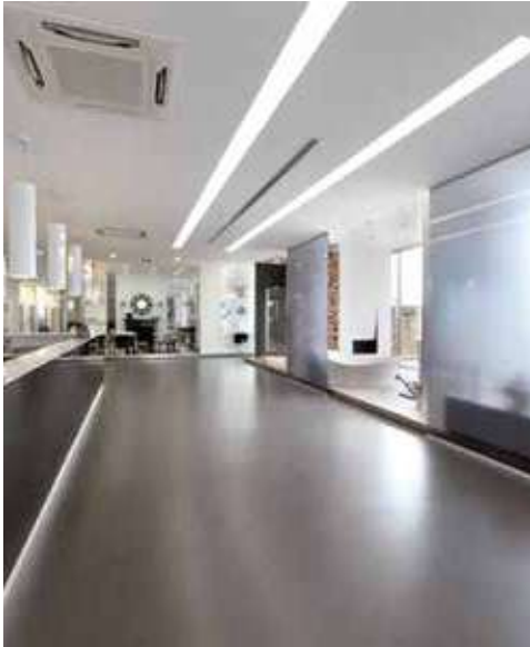
Show-Room Quartarella Altamura (BA) - Italy. "Natural effect" anthracite Ultratop

of Mapelux Lucida or Mapelux Opaca metallic wax to make successive cleaning and maintenance operations simpler.