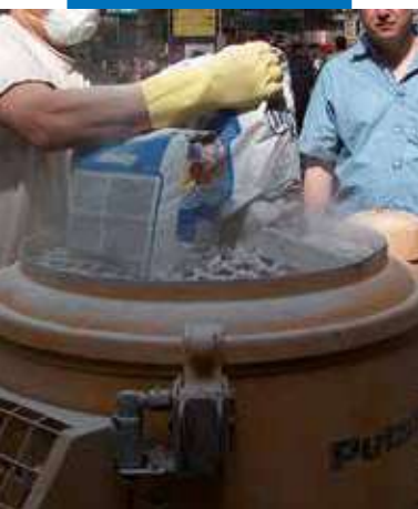
Preparation of Ultratop in a mixer