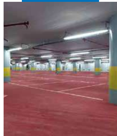
Floor made using red Ultratop in the Berlaymont Building, Brussels