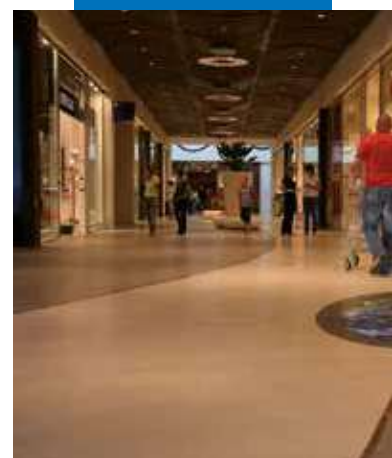
The final result of a floor made using Ultratop