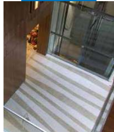
Hotel Design - Budapest - Hungary. "Terrazzo alla veneziana" effect Ultratop