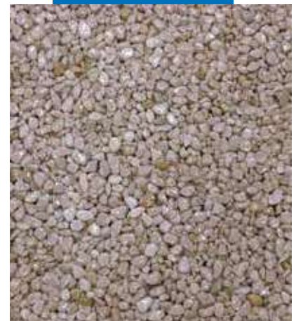
Application of the mixture of natural aggregates + Mapefloor I 910