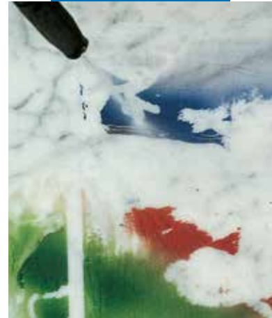
Using a high-pressure cleaner on Carrara marble treated with WallGuard Graffiti Barrier