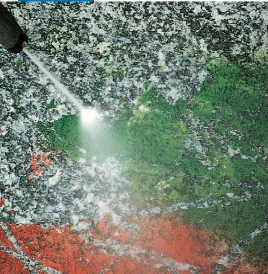
Using a high-pressure cleaner on granite treated with WallGard Graffiti Barrier