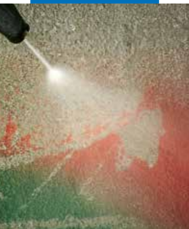
Using high-pressure cleaner on concrete treated with WallGard Graffiti Barrier

Note: Graffiti should be removed from surfaces treated with WallGard Graffiti Barrier by using a high pressure cleaner with water at +80°C. We recommend verifying beforehand that the substrate can withstand the physico-mechanical stress.