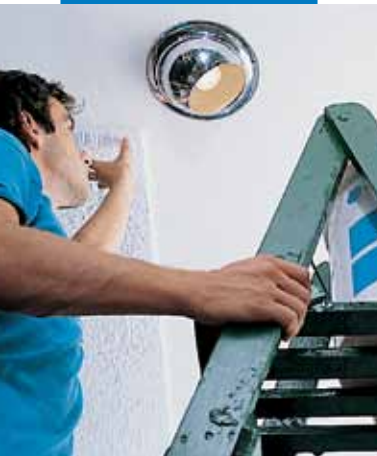
Installing an expanded-polystyrene ceiling