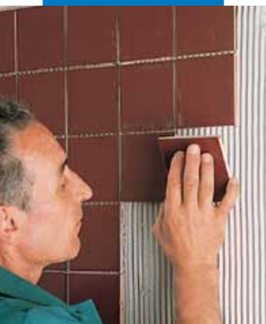
Tiling on gypsum plaster