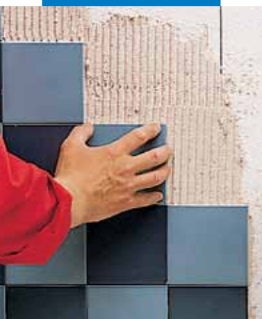
Tiling on expanded polystyrene