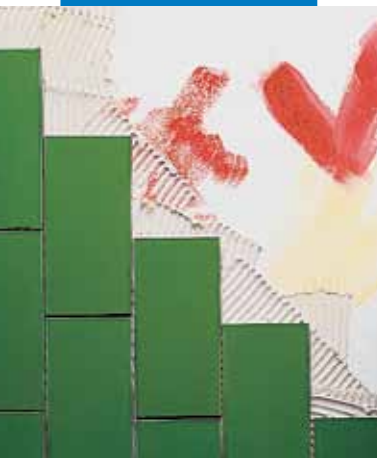
Tiling on painted walls