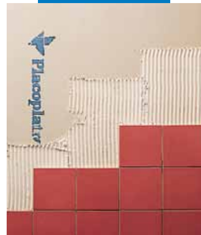
Tiling on gypsum board