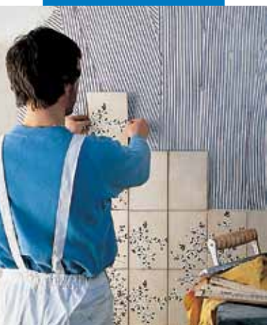
Tiling on ordinary plaster

In these situations, use specialized products from the MAPEI range.