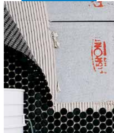
Tiling on fibre-cement