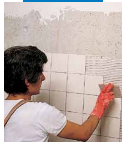
Tiling on reinforced- concrete walls