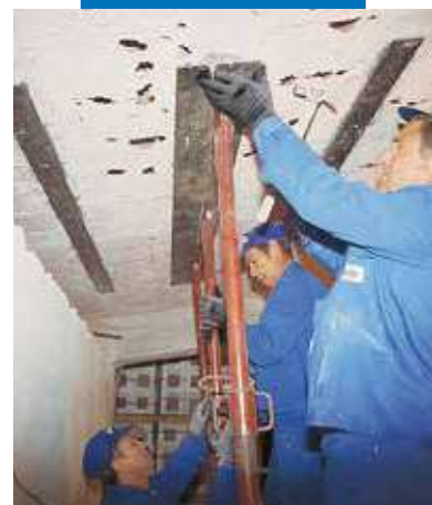
Placing metal sheet for structural reinforcement