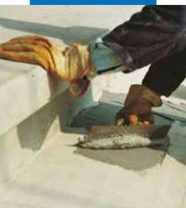
Application of Adesilex PG1 with a notched trowel for structural bonding of pre-fabricated steps