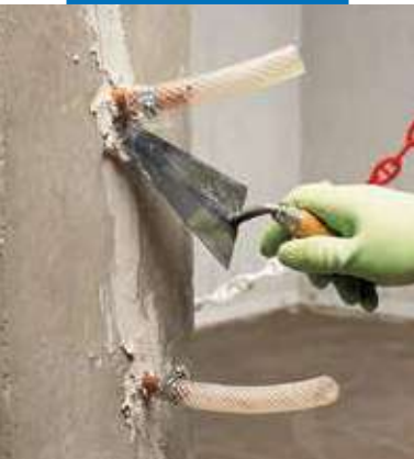
Fixing injection tubes and sealing cracks for structural consolidation