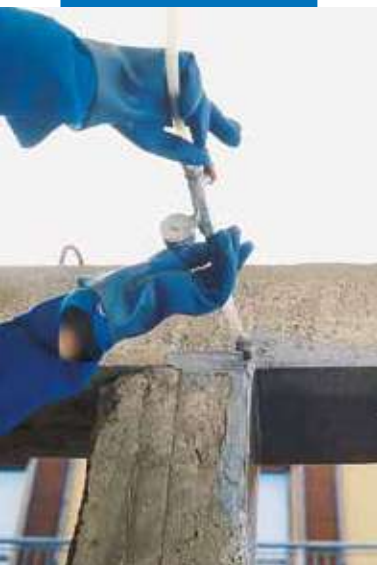
Column cladded with Adesilex PG1