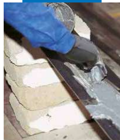
Application of Adesilex PG1 on metal sheet