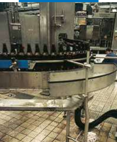
An example of a grouted brewery floor