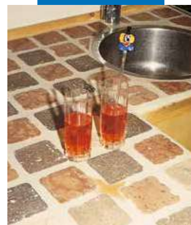
An example of a bonded and grouted kitchen worktop