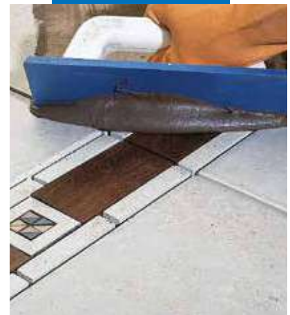
Grouting a ceramic tile floor with wood inlays with a trowel