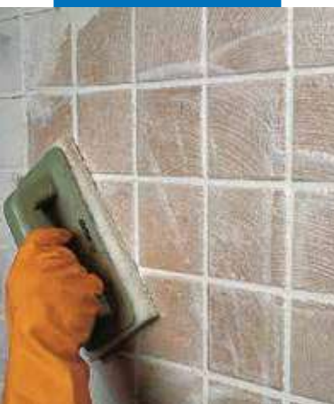
Finishing of single fired tile wall with a Scotch-Brite® pad