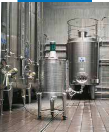
An example of a grouted wine cellar floor