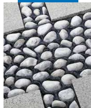
An example of grouted ornamental stones