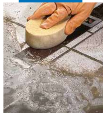
Finishing a ceramic tile floor with wood inlays with a sponge