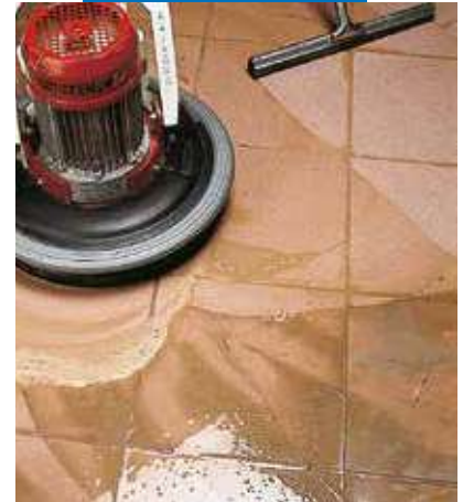
Finishing a porcelain tiled floor with single-brushed power float or rubber squeegee