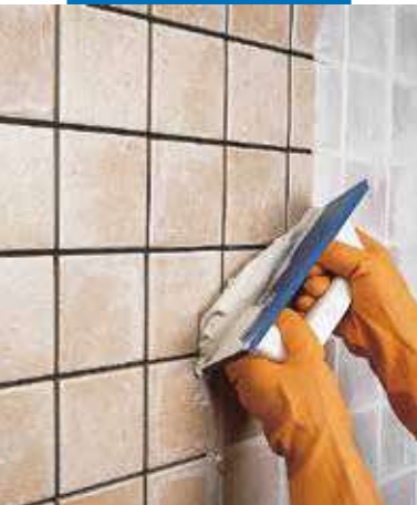
Grouting of single fired tile wall with a float