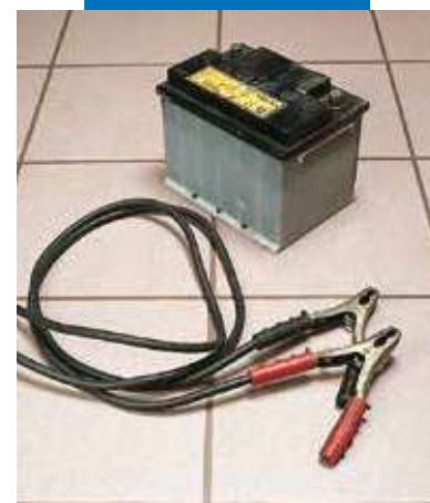
An example of a grouted battery room

Kerapoxy is supplied, with mixing proportions carefully measured, in drums containing component A and bottles of component B to be mixed when using the product. The total weight of the units is: 10, 5 and 2 kg in total.