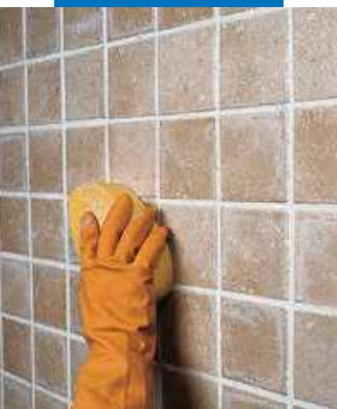
Finishing of single fired tile wall with a sponge