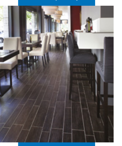
Alcuino Bar -Milan - Italy

an overall cure of at least 28 days unless they have been made with the special MAPEI binders for screeds such as Mapecem or Topcem or with ready-mixed mortars such as Mapecem Pronto or Topcem Pronto .