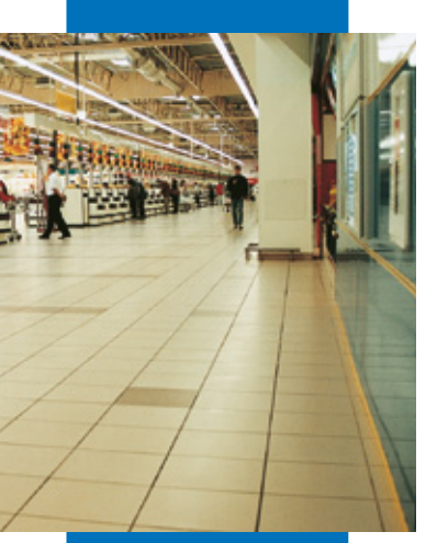
An example of an installation with Keraquick S1 in an Auchan supermarket -Sosnowiec (Poland)