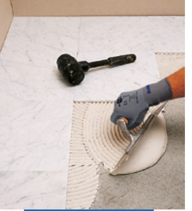
Setting white Carrara marble with Keraquick S1 white