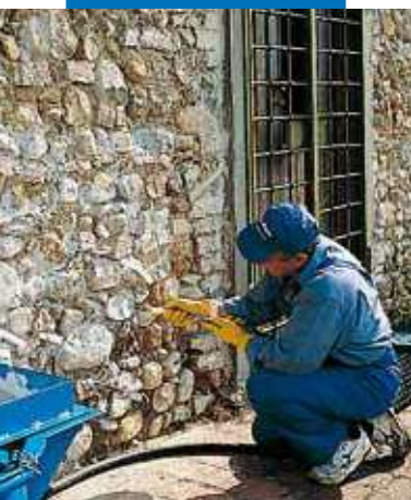
Consolidating injection with Mape-Antique I