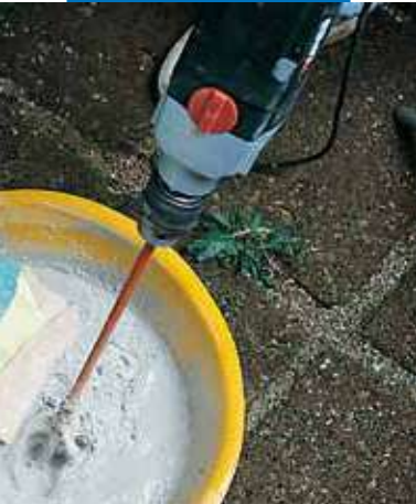
Preparation of Mape-Antique I