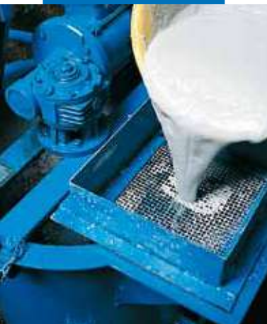
Filling of the injection pump with Mape-Antique I