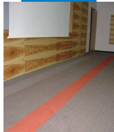
Example of Primer G applied before spreading on Ultraplano Eco and Rollcoll adhesive, used to bond carpet in a hotel room - Villa Hotel Castellani - Austria