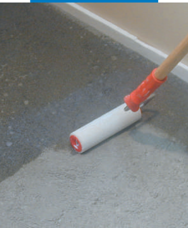
Applying Primer G with a roller