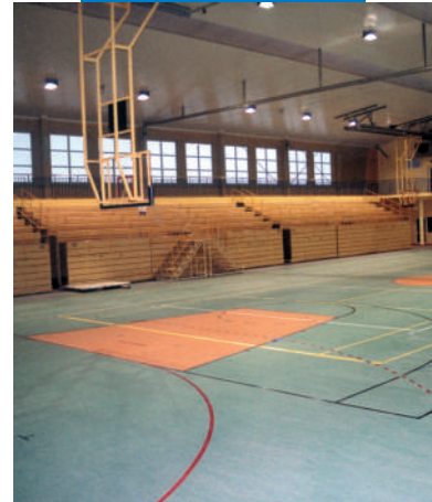
Example of Primer G applied before laying PVC and linoleum in a public gymnasium - Gdansk Orunia Indoor Gymnasium - Poland

All relevant references for the product are available upon request and from www.mapei.com