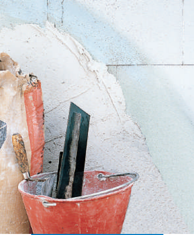
Use as a primer for gypsum plasters