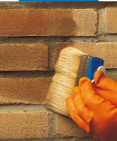
Applying Antipluviol S by brush