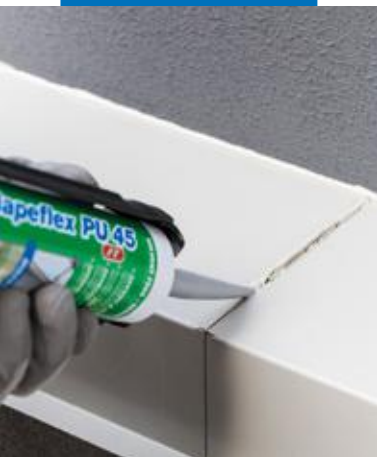
Flexible sealing of construction joints