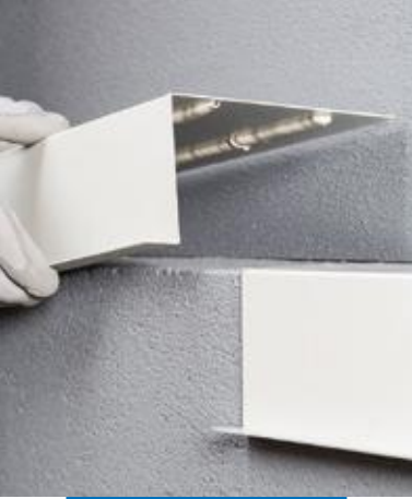
Flexible bonding of construction members and features

When bonding sections with a restricted surface area or weight, extrude single drops of the product on the back of the section and press it well down onto the substrate to