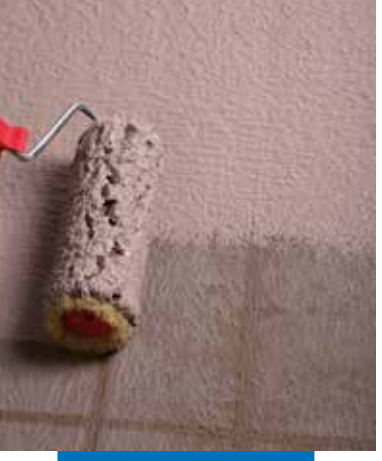
Waterproofing of details by roller