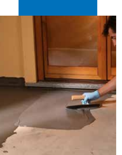
Waterproofing of terraces by trowel

brush, by roller or by spraying with a worm screw rendering machine on both horizontal and vertical surfaces at a thickness of approximately 2 mm. Due to the content and high quality of the synthetic resins, the hardened layer of Mapelastic Smart remains constantly flexible under all environmental conditions.